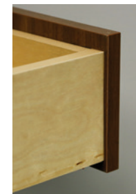
Plywood Butt Joint