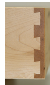
Hardwood or plywood Dove Tail (choose species)