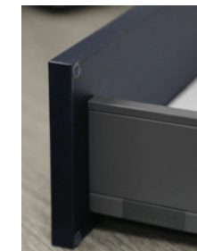
Metal Drawer (Limited Sizes and Colors Available)