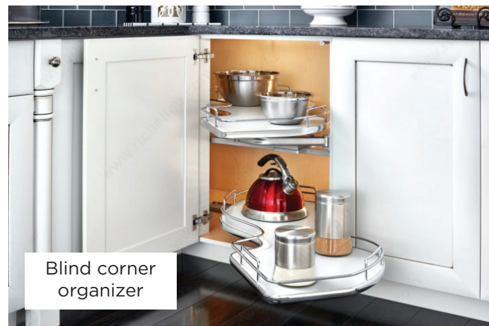
Blind corner organizer