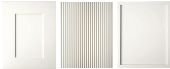
Brookside Tambour - 1/2" Summit