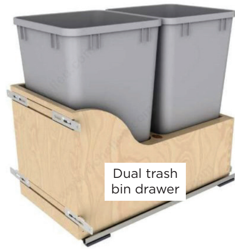
Dual trash bin drawer

Select the custom additions and accessories that add functionality and ease to your space.